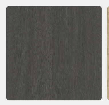
Havana Oak (Woodmat)