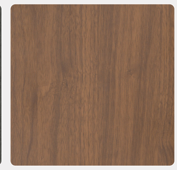
Florentine Walnut (Woodmat)