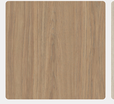
Prime Oak (Woodmat)