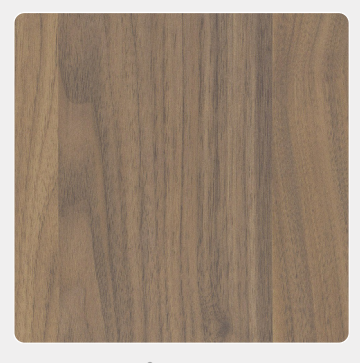
Notaio Walnut (Woodmat)