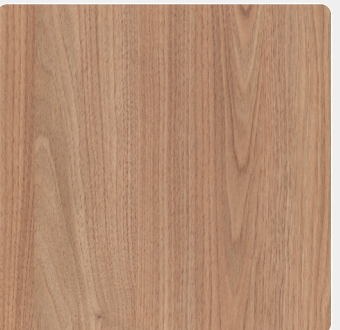
Tasmanian Oak (Woodmat)