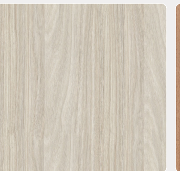
Soft Walnut (Ravine)