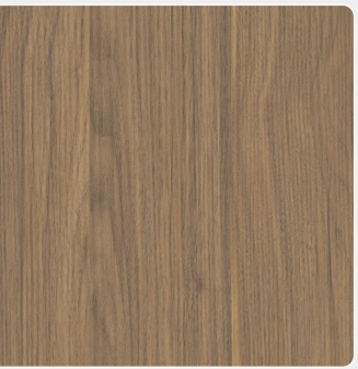
Notaio Walnut (Ravine)