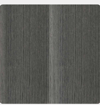
Char Oak (Ravine)